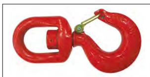
Safety: homologated self locking swivel hook