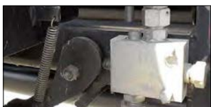
Safety: end of cable/ hook upper position automatic movement stop